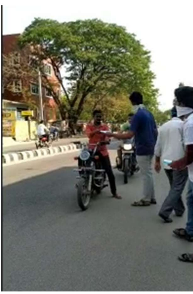
Distribution of Masks and Sanitizers by students