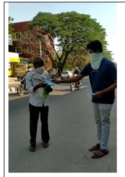
Distribution of Masks and Sanitizers by students

This social work was done by our NSS Volunteers during the pandemic on 28<sup>TH</sup> June 2020. As we all know that the covid-19 pandemic is a major threat to global health and the economy, the full impact of which is yet unknown. But this pandemic cannot be controlled by the government alone. It needs the participation and passion of all the people in our country. The CMRIT NSS cell Volunteers did their part by distributing masks and sanitizers.