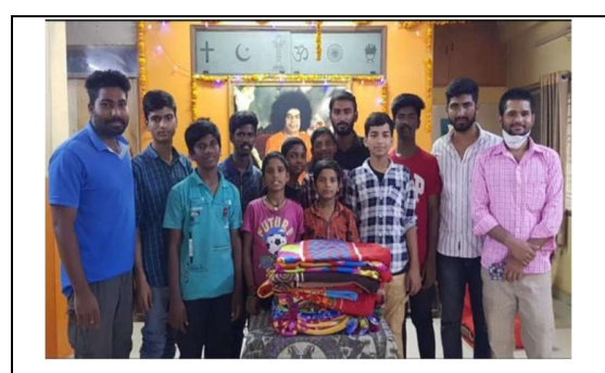
Distributing the blankets to the homelesspeople

For many of us, winter means being in a cozy bed under a roof. But for the homeless people winter season can be the brutal challenge and are at a risk of experiencing the severe illness. So the team Street Cause CMRIT took an initiative by distributing the blankets to the homeless people.