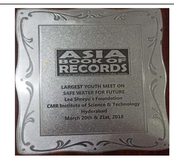
Asia books of records 2018