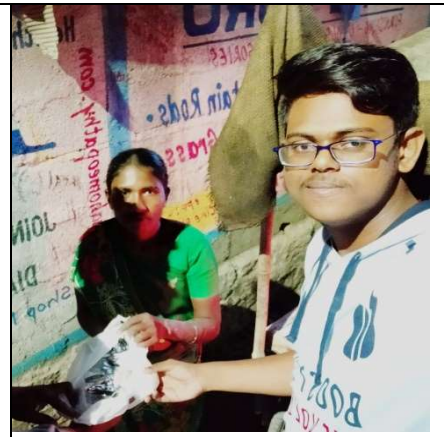
Food distribution to the needy by students