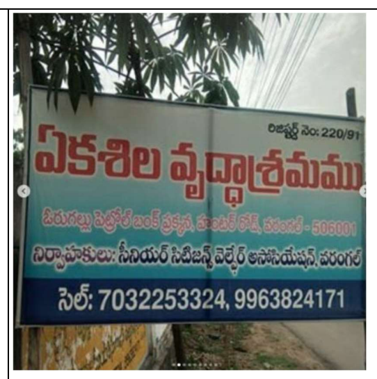
Renovation of washroomsat old-age home.