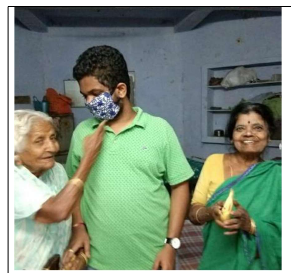
Appreciation of the CMR Student for Renovating thewashroomsat old age home.

Ekashila old age home is facing financial crises due to which they are not in a situation to renovate the old damaged washrooms. So keeping the inconvenience of old people living old age home in mind, we have decided to renovate two washrooms which is going to be a permanent project under RFC projects.