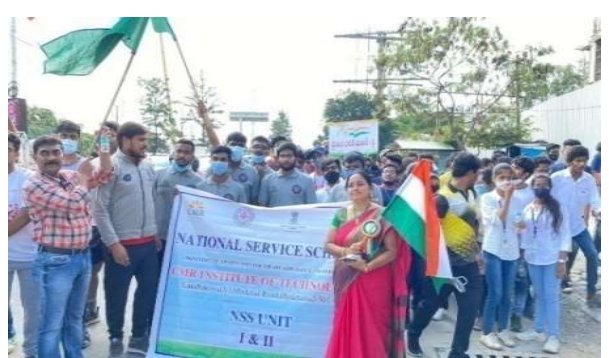
Gandhi Jayanti march 21

On the occasion of Gandhi Jayanthi, JNTUH NSS organized a special program" Fit India Freedom Run 2. O", at Shilparamam, Hitech city Hyderabad on 2<sup>nd</sup> October 2021 to commemorate the birth anniversary of Gandhiji. It was a two kilometers run, the prime purpose of the program was to promote the values, principles, and teachings of M.K.Gandhi and their contributions to nation-building amongst students.NSS Volunteers from different colleges participated in the event in large numbers to celebrate the Jayanthi.