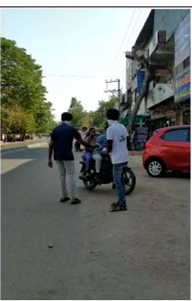
Distribution of Masks and Sanitizers by students