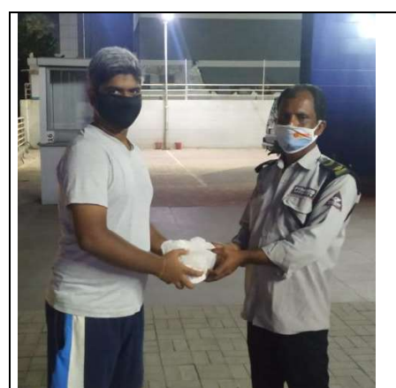
Food distribution to the needy by students

This happened on 24th September 2020 on the account of NSS Day. As we all know how covid-19 has drastically changed everyone's life. The ongoing nationwide lockdown by the government in the wake of COVID-19 pandemic has hit the poor and daily wage laborers the most as they struggle to make ends meet. With work completely drying up, these migrant workers are left with almost no savings or ration to survive this dire situation. To help the needy during this crucial time, our NSS volunteers took a huge step by distributing food to the needy in their nearby places.