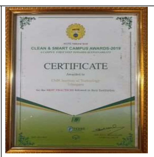
Clean and smart campus award 2019