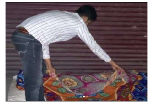
Distributing the blankets to the homeless people

Principal CMR INSTITUTE OF TECHNOLOGY Kandlakoya (V), Medchal Road, Hyderabad-501 401.