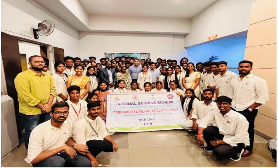
CMRIT NSS Team with Guest