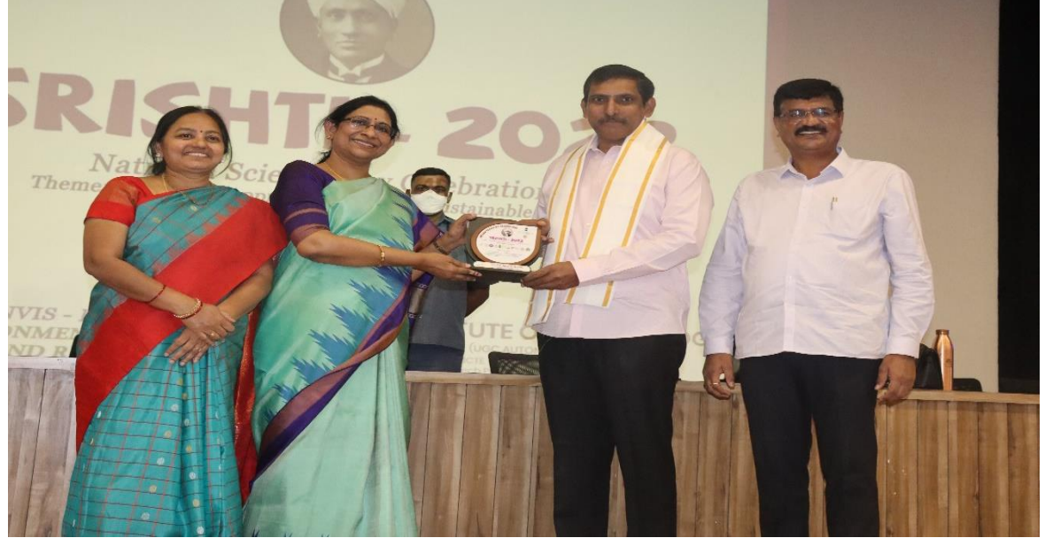
Momento presented by Secretary to the guest