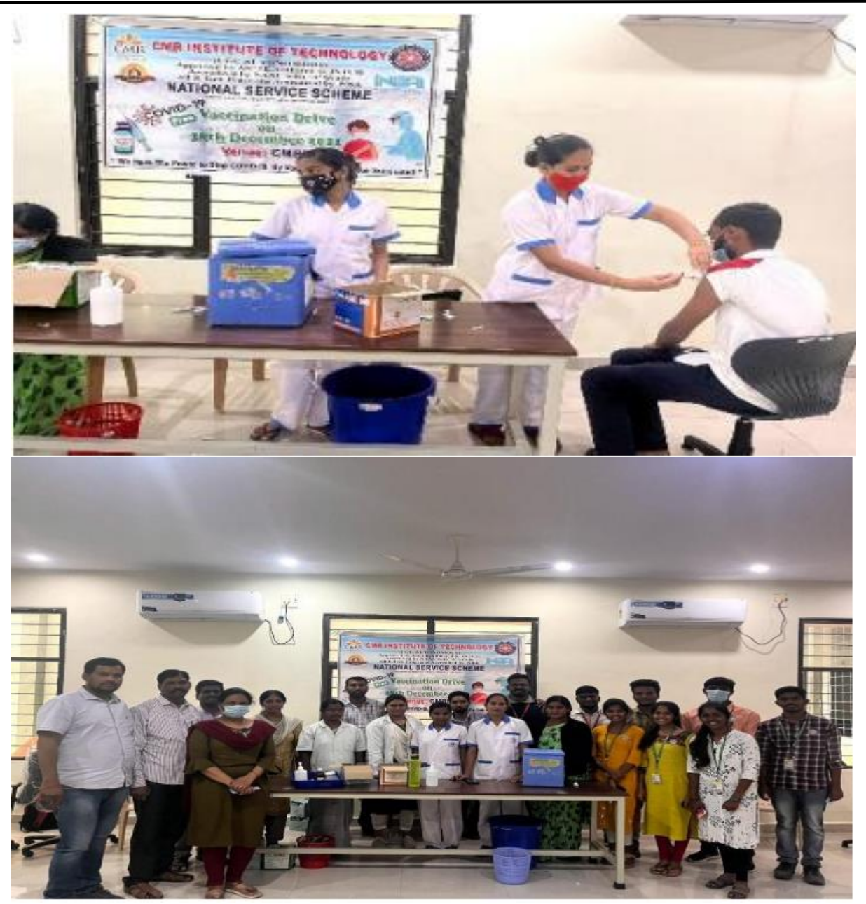
NSS Team and Vaccination Team at the Institution

(Approved by AICTE, Permanently Affiliated to JNTUH, Accredited by NBA & NAAC with 'A' Grade) Kandlakoya (V), Medchal District, Hyderabad-501 401