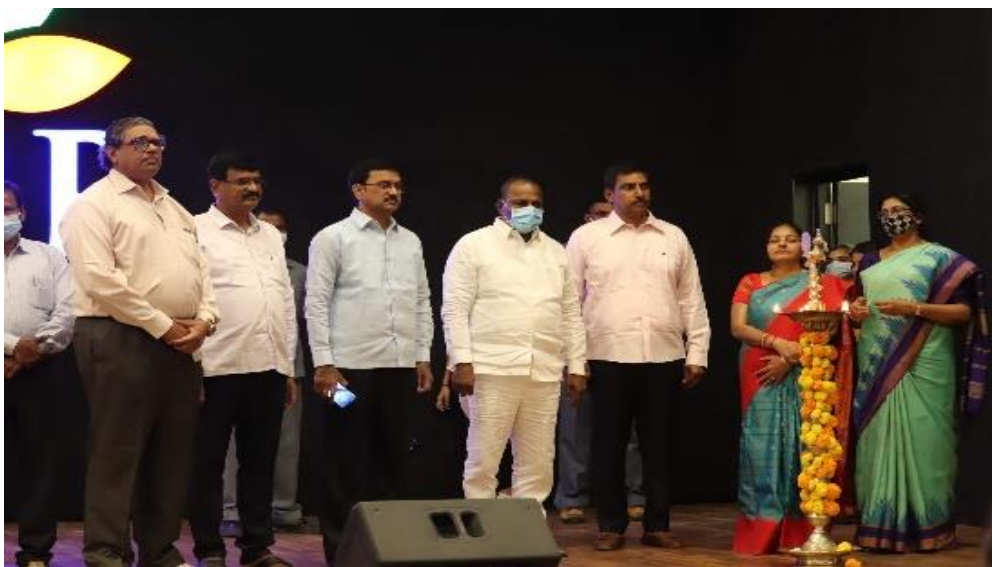
Lighting the lamp in inaugurating the event

(Approved by AICTE, Permanently Affiliated to JNTUH, Accredited by NBA & NAAC with 'A' Grade) Kandlakoya (V), Medchal District, Hyderabad-501 401