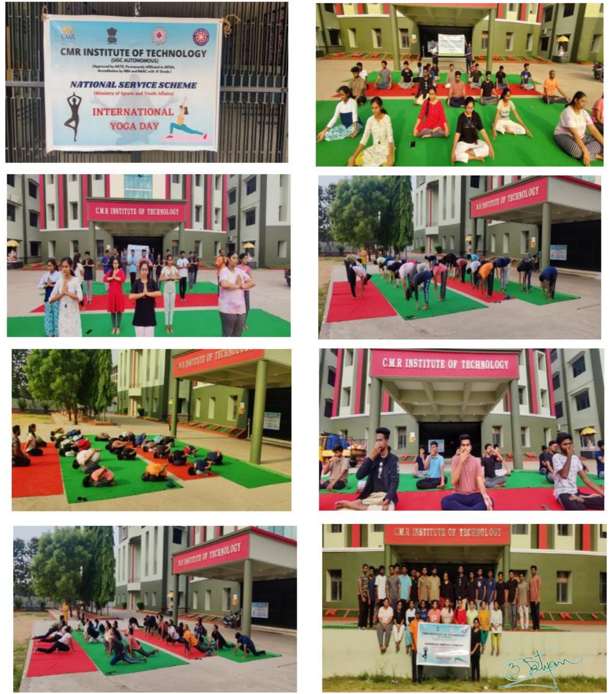
Students performing the Yoga Asanas at College during the International Yoga Day CMR INSTITUTE OF TECHNOLOGY Kandlakoya (V), Medchal Road, Hyderabad-501 401.

Yoga is an ancient physical, mental and spiritual practice that originated in India. The word 'yoga' derives from Sanskrit and means to join or to unite, symbolizing the union of body and consciousness. Today it is practiced in various forms around the world and continues to grow in popularity. Recognizing its universal appeal, on 11 December 2014, the United Nations proclaimed 21 June as International Yoga Day by resolution 69/131. June 21, which is the Summer Solstice, is the longest day of the year in the Northern Hemisphere and has special significance in many parts of the world.