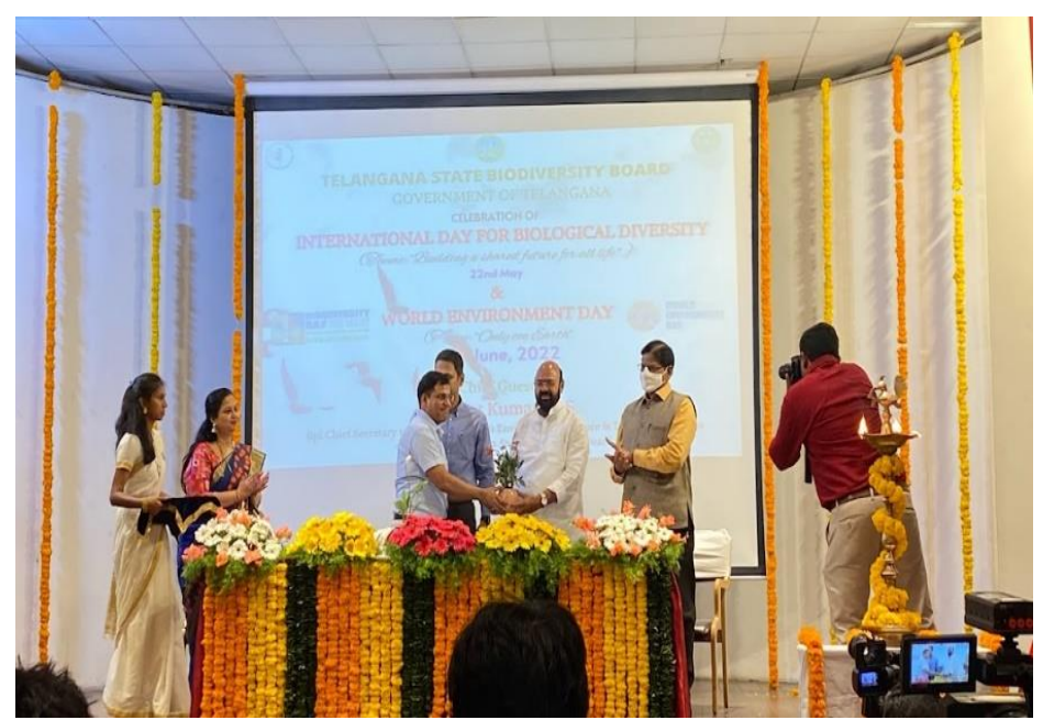
Guest invited to the dias to commencement of the event

(Approved by AICTE, Permanently Affiliated to JNTUH, Accredited by NBA & NAAC with 'A' Grade) Kandlakoya (V), Medchal District, Hyderabad-501 401