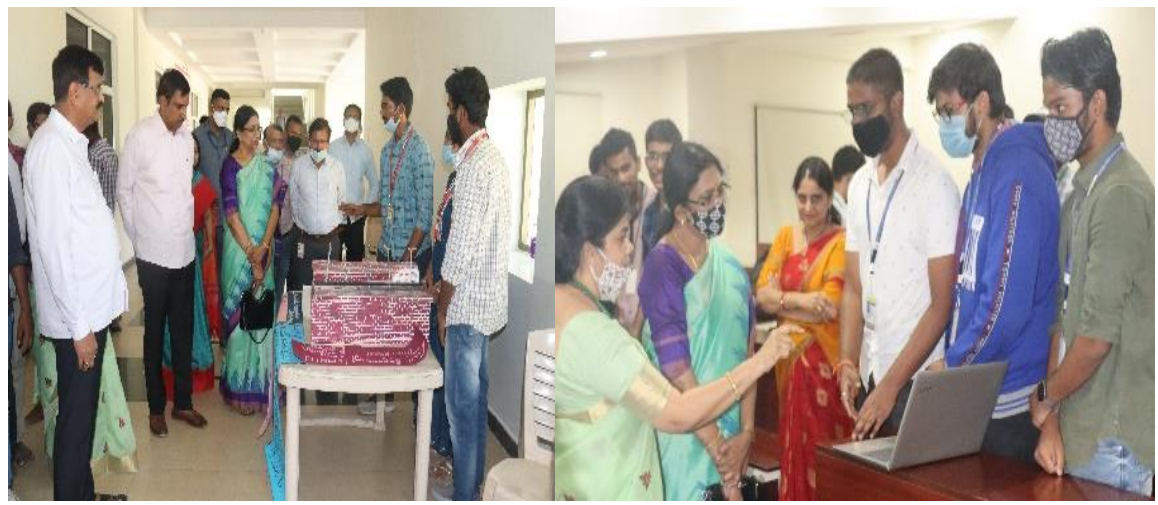
Students presenting the Projects

(Approved by AICTE, Permanently Affiliated to JNTUH, Accredited by NBA & NAAC with 'A' Grade) Kandlakoya (V), Medchal District, Hyderabad-501 401