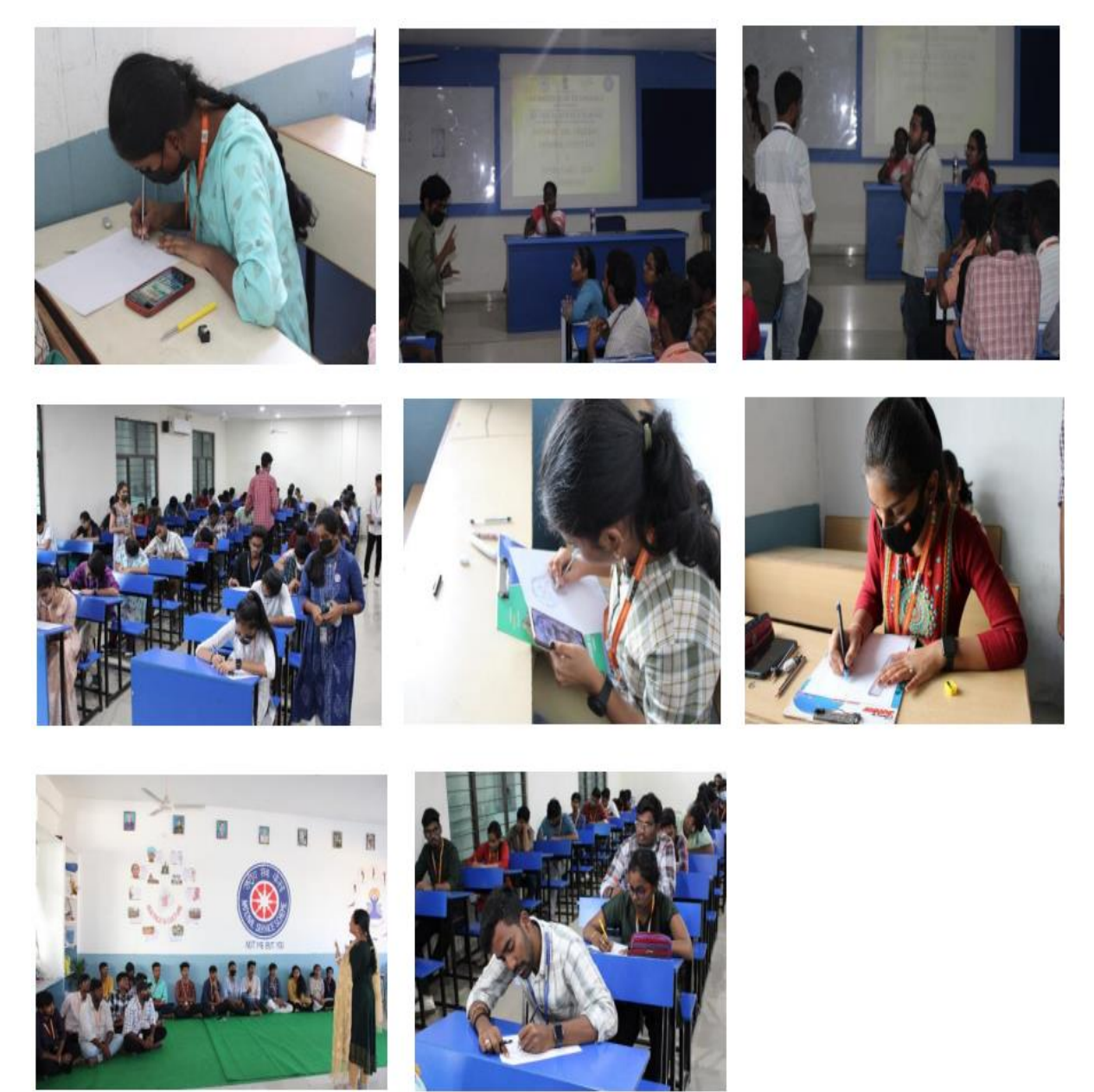
Students are performing activities during the event

In order to encourage more young voters to take part in the political process, Government of India has decided to celebrate January 25 every year as "National Voters' Day". It has been started from 25 January 2011 to mark the foundation day of Election Commission of India.